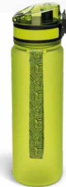
light green 52129-LGN