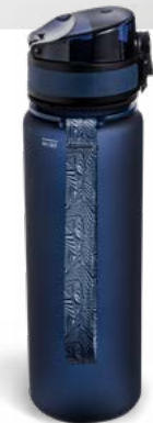
dark blue 52129-DBE