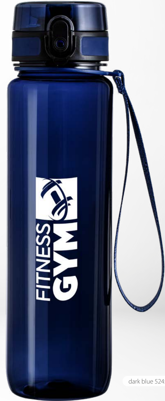
dark blue 52453-DBE