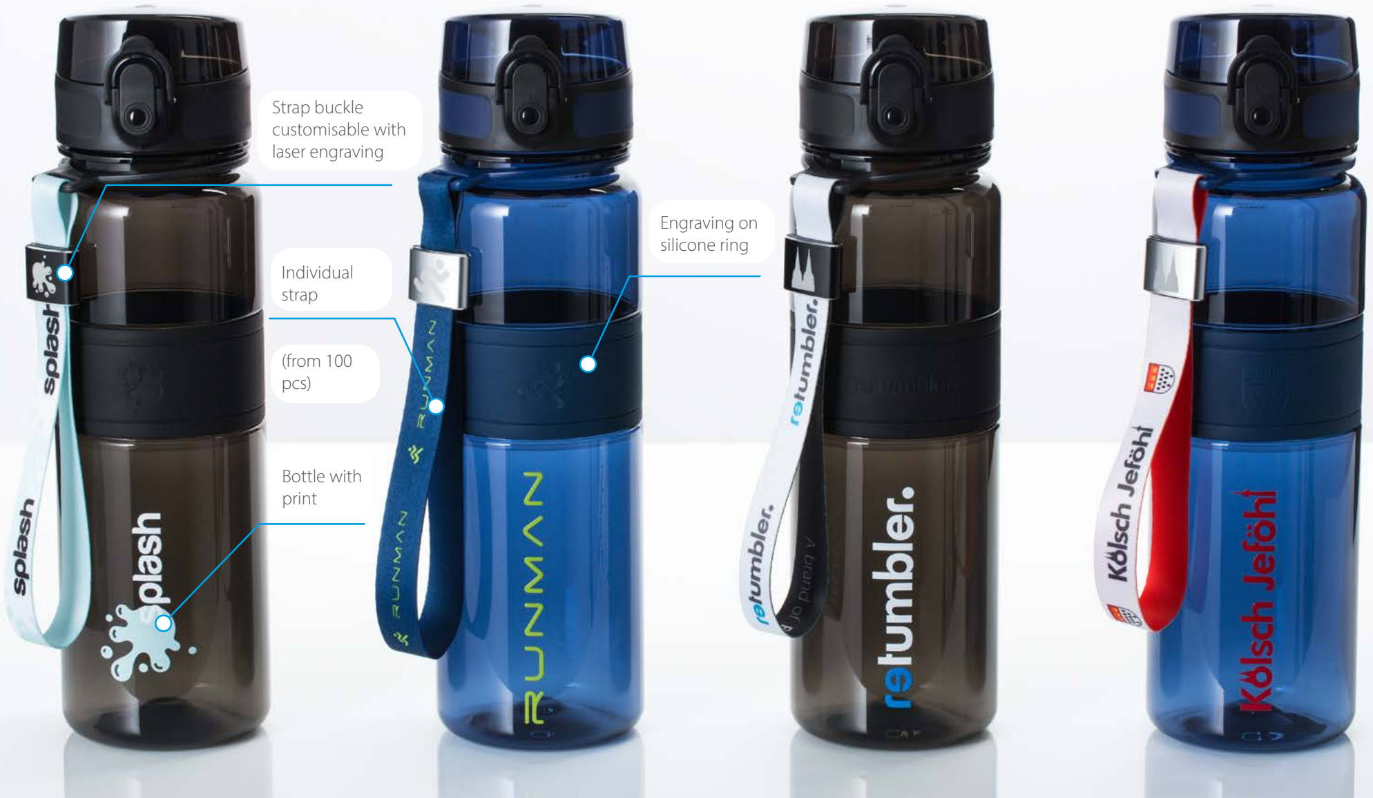
Customization example with UV Print