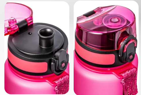
Customization example with UV Print