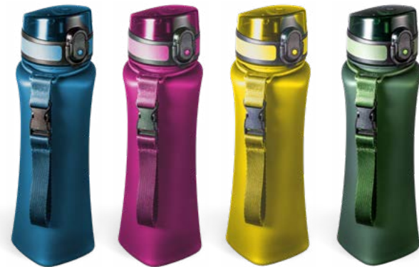
Customization example with UV Print

Starting at 3000 pieces: Petrolina in own colour (close to pantone)