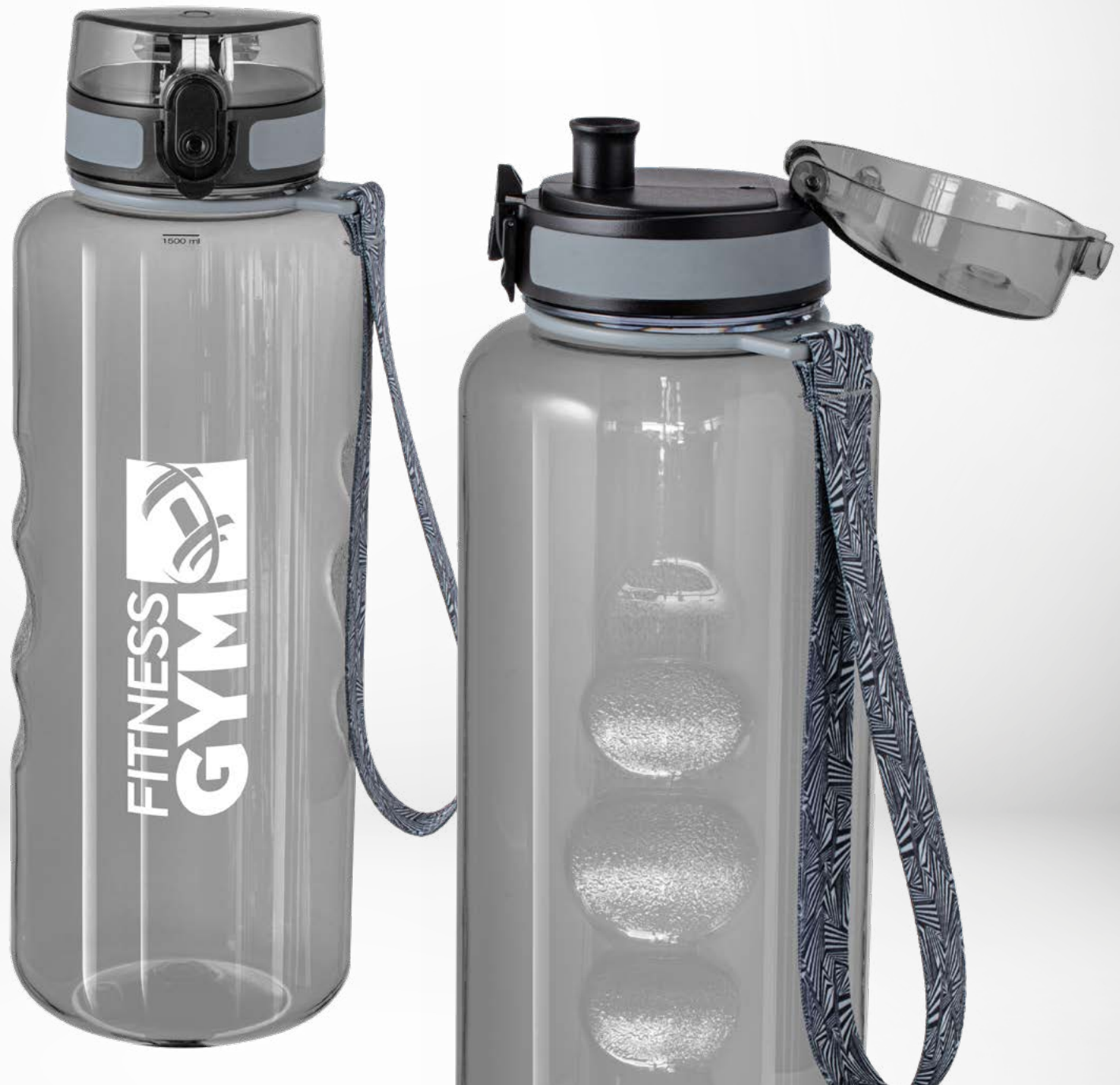
Customization example with UV Print