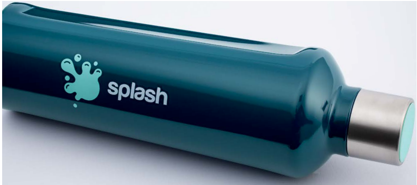
Body special colour according to Pantone from 2.000 pieces