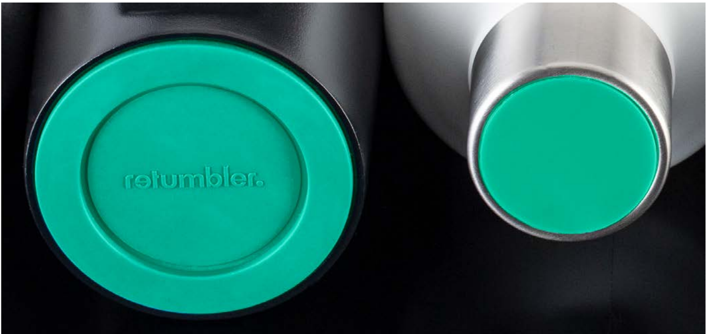
Lid inlay special colour according to Pantone from 2.000 pieces Soft bottom special colour according to Pantone from 1.000 pieces