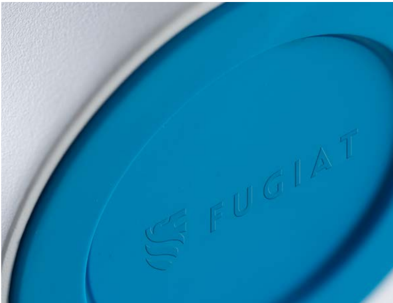
Logo embossing from 2.000 pieces