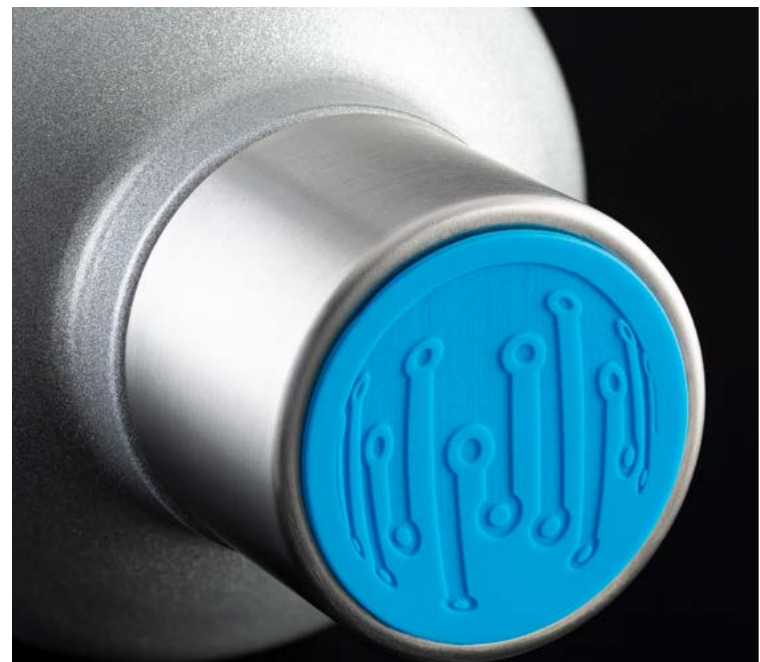
Logo embossing from 2.000 pieces