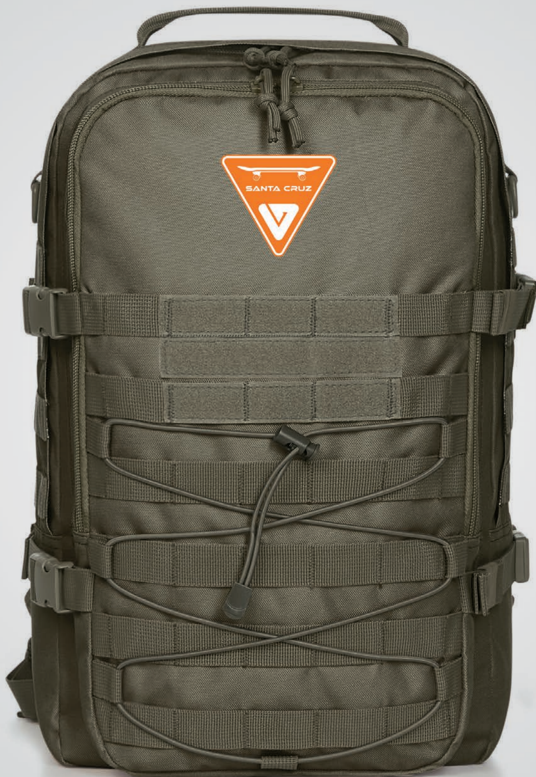
1818057 notebook backpack MOLLE