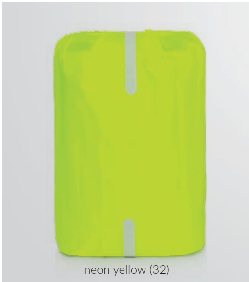
neon yellow (32)