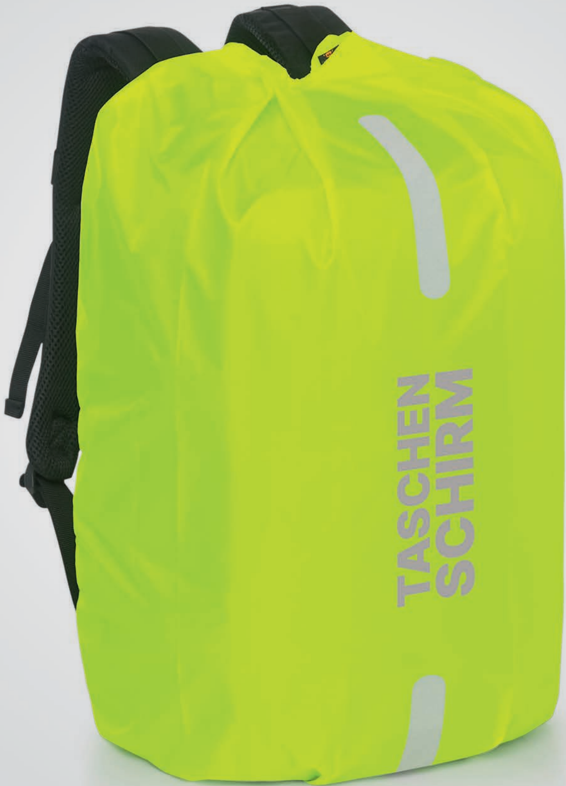
1816512 rain cover REFLEX