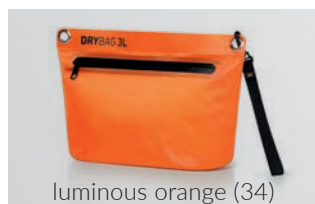
luminous orange (34)