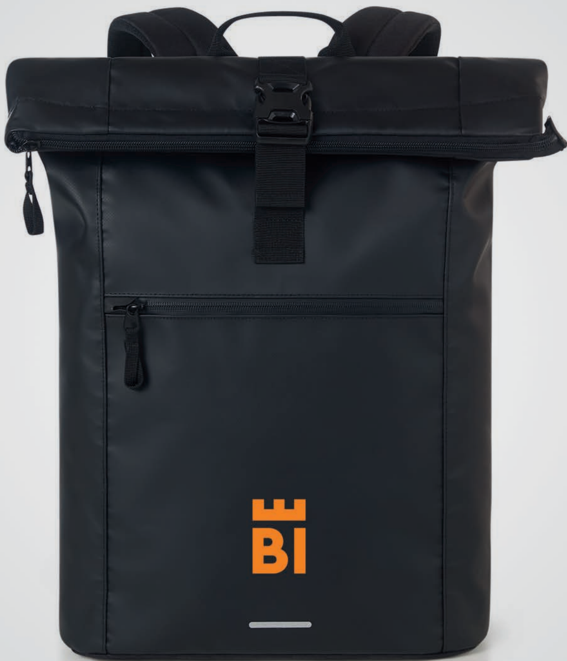
1816511 notebook backpack KURIER