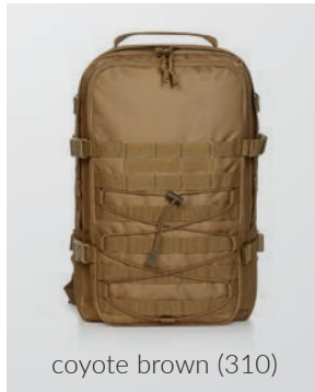
coyote brown (310)