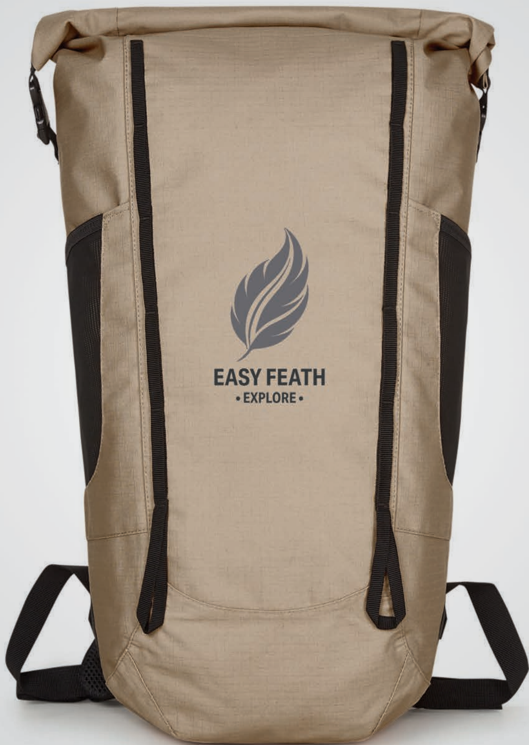
1818054 backpack EXPLORE