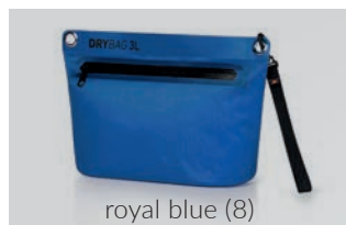
royal blue (8)