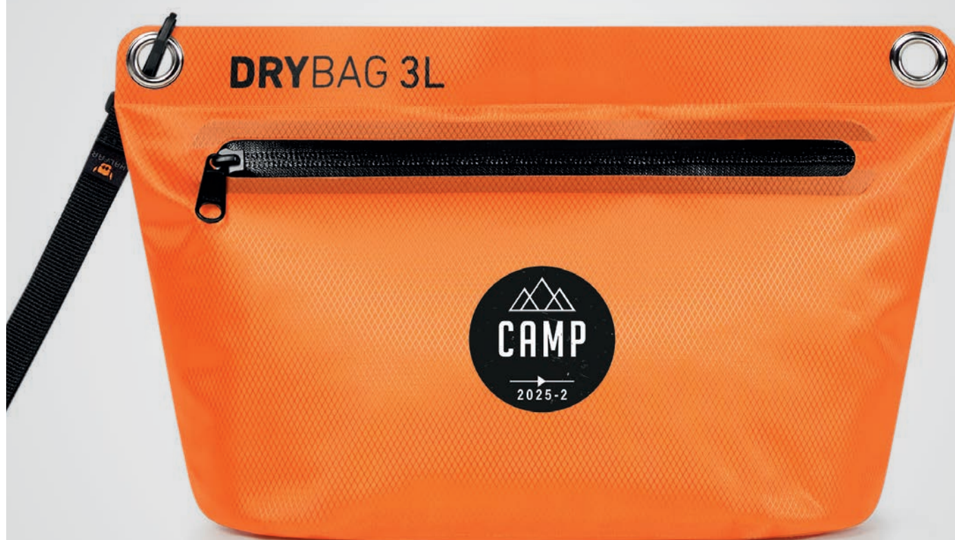
1818053 zipper bag DRYBAG