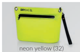
neon yellow (32)